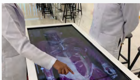
Electronic Dissection Table