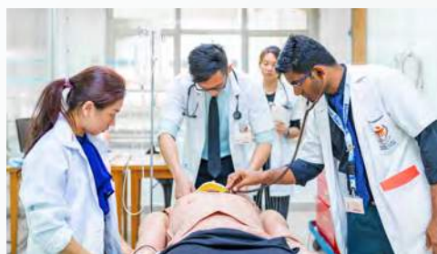
Clinical Skills Lab